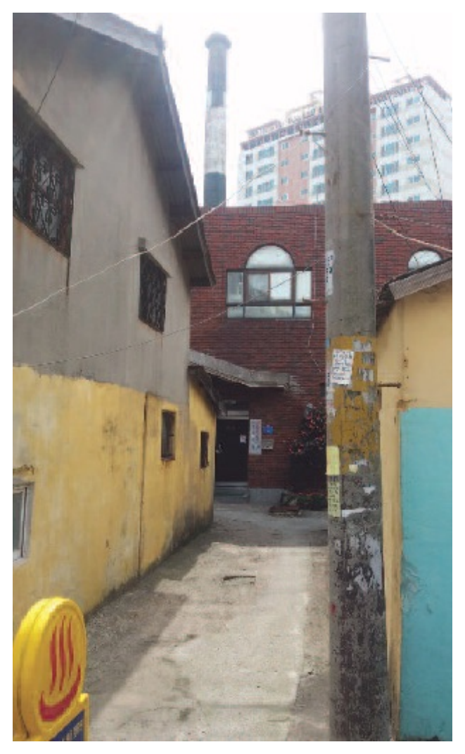
Fig 6. "Jangsutang" at the place of Hayashikane Public Bath. 48

they did not accept the idea of people taking baths together in the nude. Therefore, it was difficult to initiate the construction.<sup>46</sup> As seen here, there was a culture of being mixed together in migrant fishing villages while conflicts occurred. In 1915, the number of public baths increased to nine, including Hayashikane Public Bath. In the 1930s, there were two public baths in Bangeojin and Japanese in fundoshi waiting for their turn to enter public baths was a scene to watch for Joseon people.<sup>47</sup>