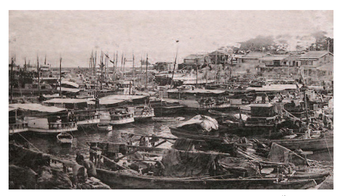
Fig 1. Bangeojin, a Japanese migrant fishing village in Japanese colonial era. 40