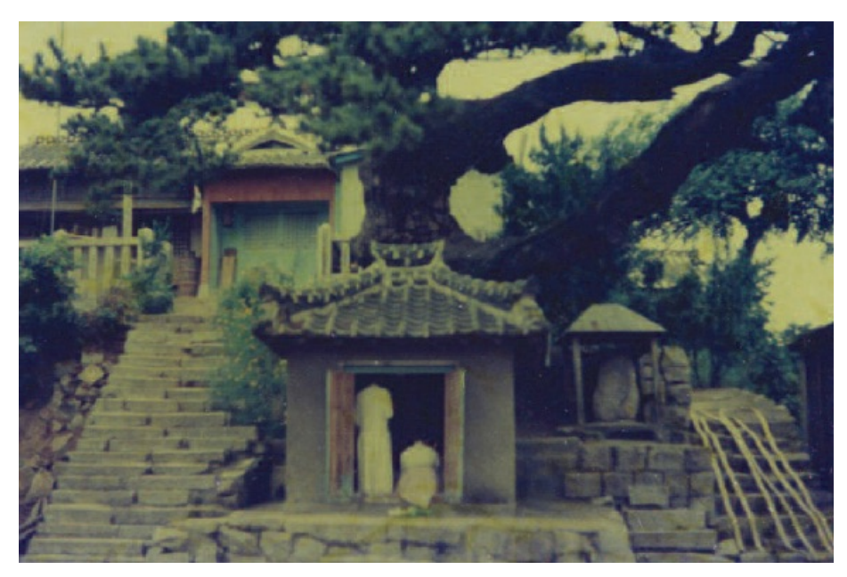
Fig 7. Bangeojin Shrine in 1960. Place of Bangeojin Shrine. 51

As seen above, Japanese people, who migrated to Joseon as part of Japan's colonial policy, had a mutually friendly exchange with Joseon people on a private level as they hired Joseon fishermen and store clerks and interacted with Korean people in public life.