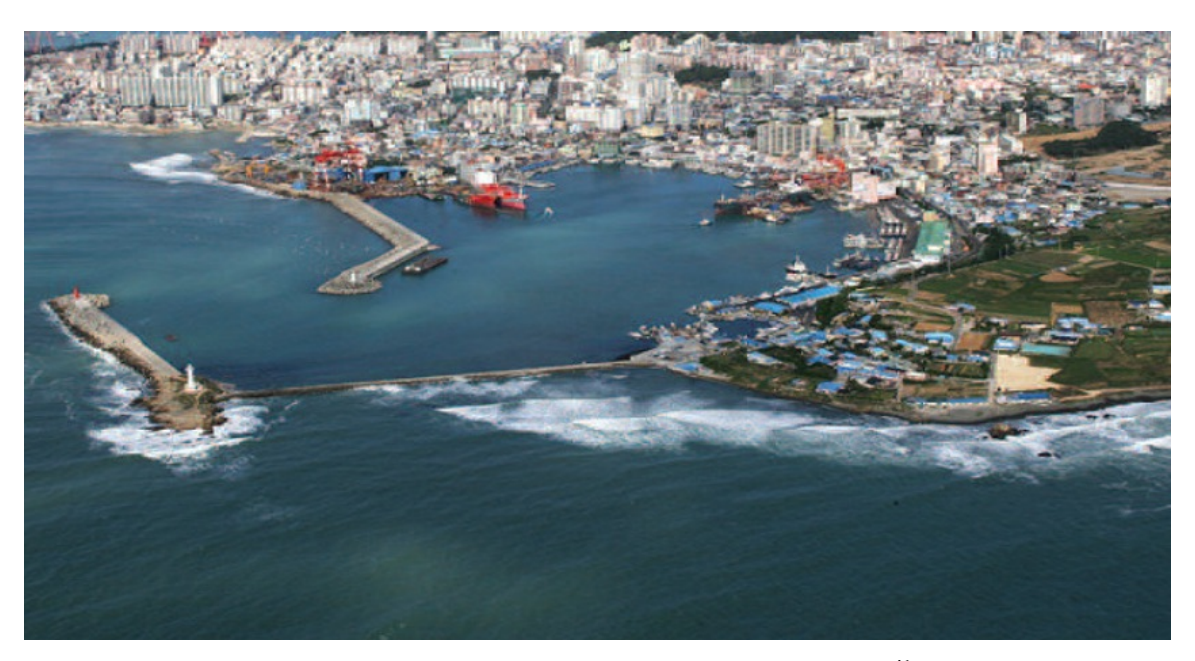
Fig 2. Bangeojin, a Japanese migrant fishing village in Modern.<sup>41</sup>

As described above, in this chapter, based on the analysis of the migrant fishing villages in Ulsan, the background of the formation of the migrant fishing villages and the fishing conditions during the colonial period were identified. As the migrant fishing villages built by Japanese people grew and became the central places of communities, the formation of the migrant fishing villages was a part of the colonial policies to colonize Joseon. It was the Japanese government's intention to have a militarily competitive edge in order to imperialize Joseon.